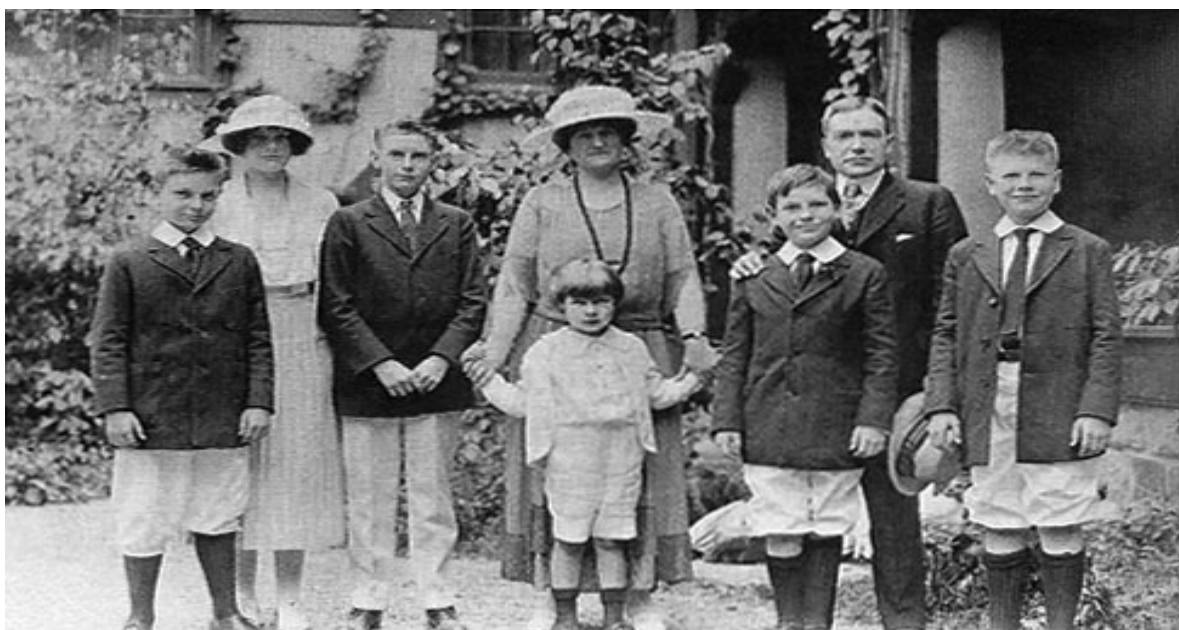
BLACK NOBILITY TERROR

The rise of the Rockefeller family was made possible from two angles by the Rothschilds. One was by the large subsidies placed on transports of Rockefeller oil. The documents of the American trade register prove that the Rothschilds, since 1896, have owned ninety-six percent of the American railways. This made it possible to transport oil on rail. When John D. Rockefeller wanted to expand, he received the financial support he needed to do so from the Rothschilds through their National City Bank of Cleveland. In exchange, the Rockefellers had to transport their oil via the Rothschilds railways. An illegal agreement saw to it that the Rockefellers received a bonus for the amount of oil they transported by train. Because of this agreement nobody could compete with the Rothschilds in transporting Rockefeller oil. This was all arranged by Jacob Schiff, of the company Kuhn & Loeb, the brain behind the foundation of the Rockefeller imperium.